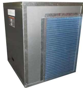
SPAC/HP Standard or High Velocity

Available in Standard and High Velocity configurations.