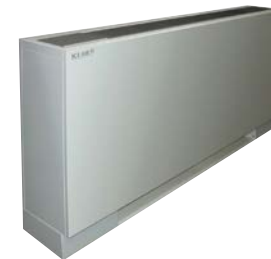
FCVE Vertical Exposed