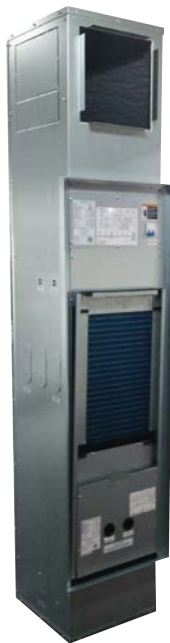
VSHPW Vertical Stack

Available in Vertical Stack, Console, Vertical Closet and Horizontal configurations.