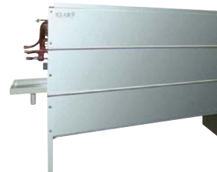
FCVC Vertical Concealed

Available in Vertical Exposed, Vertical Concealed, Horizontal Concealed, Ultra Thin and HiRise configurations.