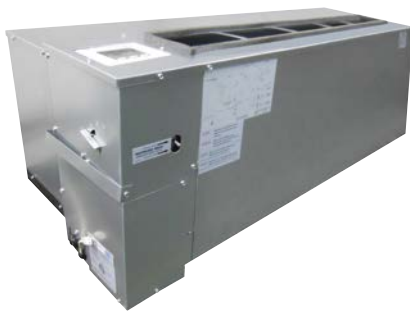
RSNU New Construction

EXACTFIT. Replacement and custom applications