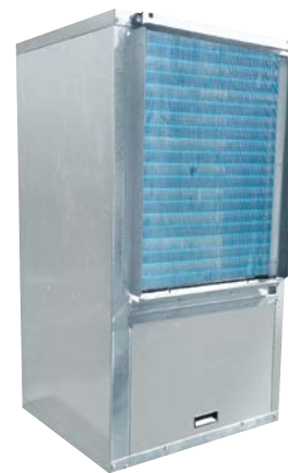
VCHW Vertical Closet

Available in Vertical Stack, Console, Vertical Closet and Horizontal configurations.